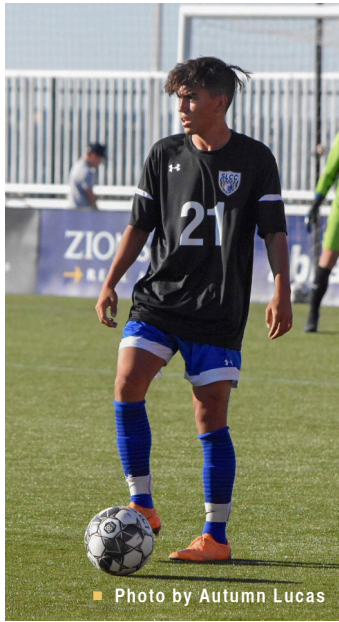
SLCC defender looking for an option up the field.