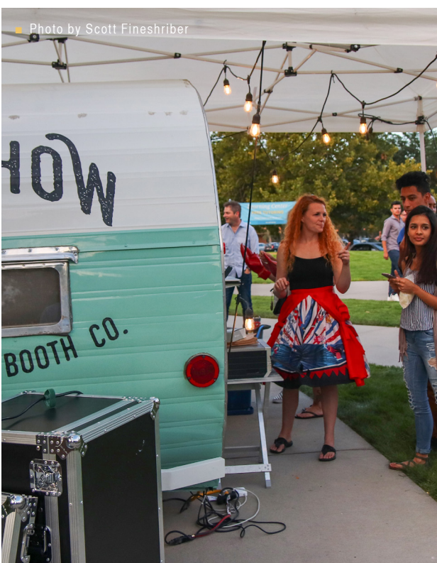
Students were able to take pictures inside the Sideshow photo booth.

Bruin Bash was the first big event of the year hosted by the Student Association (SLCCSA) at Salt Lake Community College, and everyone involved enjoyed themselves. Even with sudden gusts of wind out of nowhere, the Bruins didn't let anything stop them from having a great time.