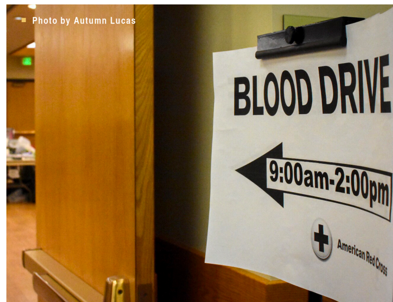
Blood Drive sign leading people to donate blood at the SLCC Taylorsville Campus on August 28th.