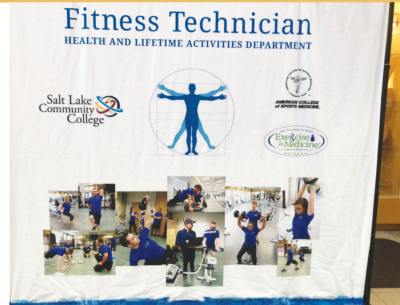
An advertisement for SLCC's Fitness Technician program displayed at the conference, featuring examples of activities students can expect to partake in.

and lead you to greater experiences in and out of school.