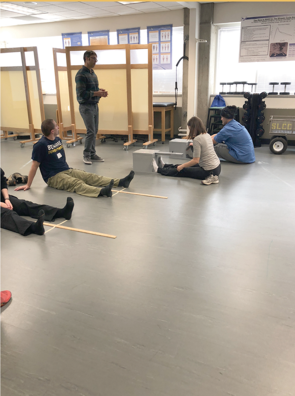
A speaker at the conference goes over the basics of fitness: touching your toes.