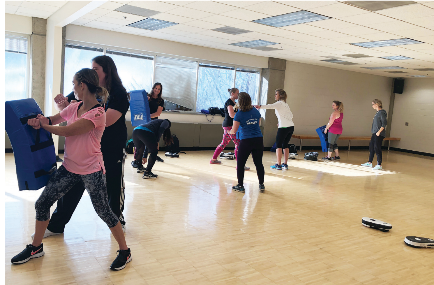
In this exercise, groups of women paired off to trade blows in a self-defense exercise.