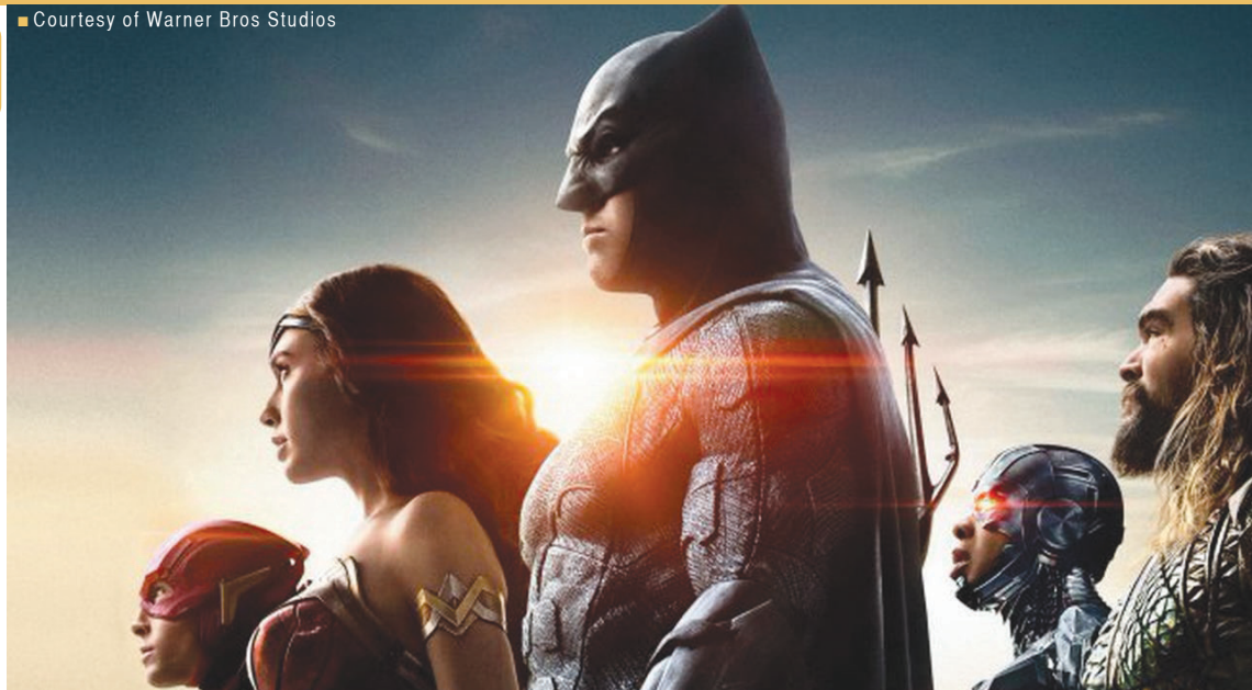
This "Snyderverse" Justice League movie is five years in the making but is somehow missing the Green Lantern. Seriously?

directors, Joss Whedon (Marvel's "The Avengers"), would agree. This CGI laden baddie is such a pushover, never possessing any attributes that would make him a viable threat to Earth or the League. Without a properly explained motivation and any semblance of a personality, it's disheartening to see the great union of DC heroes take on such a pathetic foe. His plan is to destroy Earth using a collection of cubes (which I am certain will never make a return in the films). These magical items are eerily similar to the "Infinity Stones" from Disney's Marvel Cinematic Universe. In fact, "Justice League" wants so desperately to be Marvel's "The Avengers", it's almost off-putting. There are so many similarities between the two movies that it's distracting.