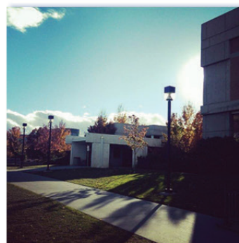
"Evening at SLCC" @smc #lifeatslcc #TaylorsvilleRedwood