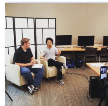
"Live facebook interview" with the documentary The Breaks

Show us #lifeatslcc through the eyes of your camera.