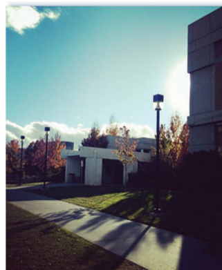
"Evening at SLCC" @smc #lifeatslcc #TaylorsvilleRedwood