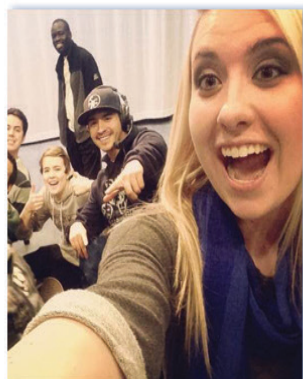
"Last day of class" selfie with my video peeps @smc #lifeatslcc #SouthCity