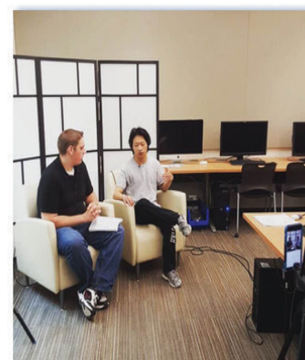
"Live facebook interview" with the documentary The Breaks @smc #lifeatslcc #SouthCity

Show us #lifeatslcc through the eyes of your camera.