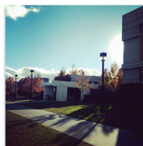
"Evening at SLCC" @smc #lifeatslcc #TaylorsvilleRedwood

Get your photo published in The Globe and win a prize.