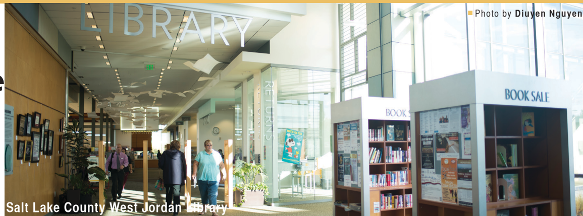
Salt Lake County West Jordan Library

Throughout a student's educational experience, extra help is always an added bonus. At Salt Lake Community College there are several tutor labs, and counselors available for help. There is also help outside of SLCC. Accessing this help is as simple as having a library card.