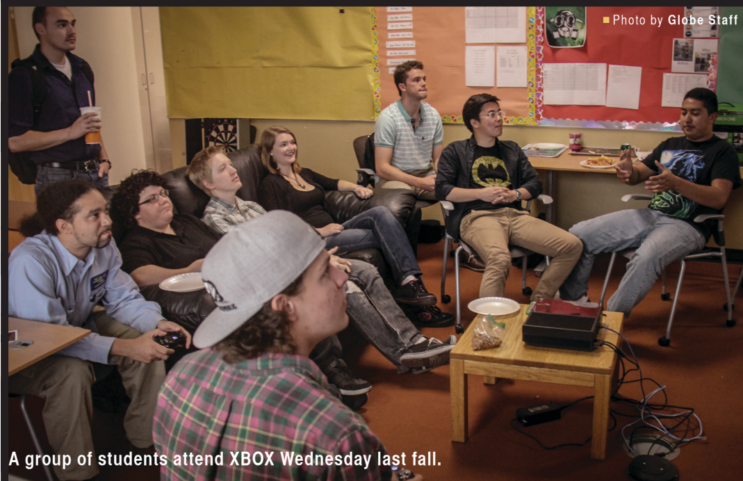
A group of students attend XBOX Wednesday last fall.