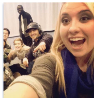
"Last day of class" selfie with my video peeps @smc #lifeatslcc #SouthCity

In the caption of your photo include @smc #lifeatslcc and hashtag the SLCC campus (#SouthCity, #Taylorsville Redwood etc.), or email contest.globe@slcc.edu