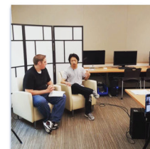
"Live facebook interview" with the documentary The Breaks @smc #lifeatslcc #SouthCity