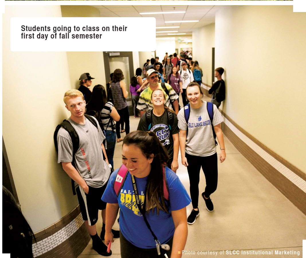
Students going to class on their first day of fall semester