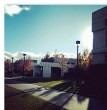
"Evening at SLCC" @smc #lifeatslcc #TaylorsvilleRedwood

Get your photo published in The Globe and win a prize.