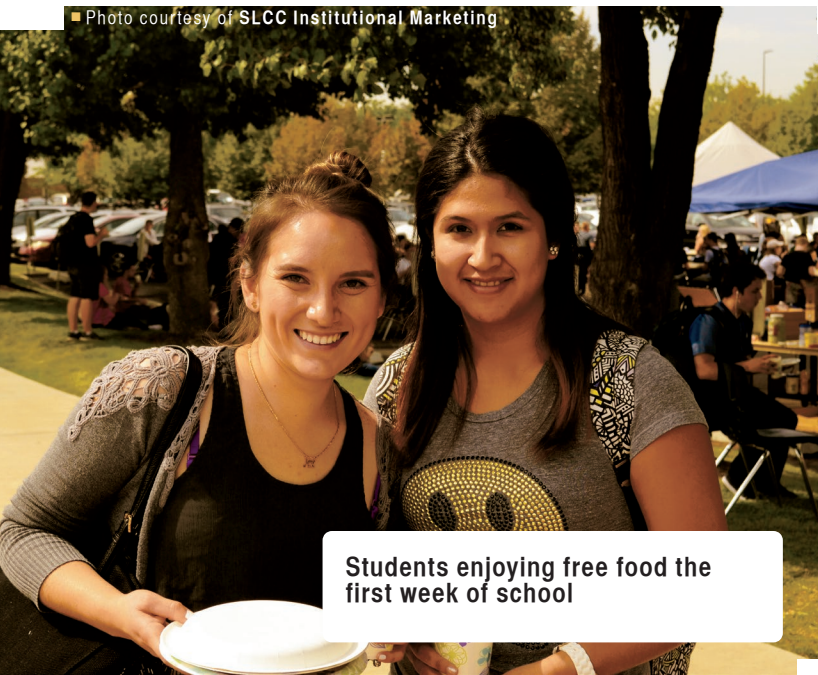
Students enjoying free food the first week of school