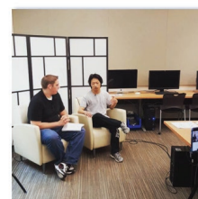
"Live Facebook interview" with the documentary The Breaks @smc #lifeatslcc #SouthCity

In the caption of your photo include @smc #lifeatslcc and hashtag the SLCC campus (#SouthCity, #TaylorsvilleRedwood etc.), or email contest.globe@slcc.edu