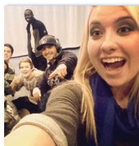
"Last day of class" selfie with my video peeps @smc #lifeatslcc #SouthCity

Show us #lifeatslcc through the eyes of your camera.